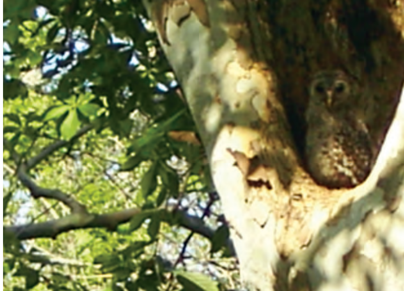
Conserving nesting sites.

Biodiversity brings benefits to the organic farm, but support of biodiversity on an organic farm also contributes to overall biodiversity in ways that go beyond the species living on the