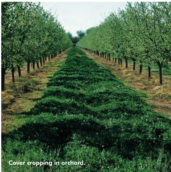
Cover cropping in orchard.

All of this pesticide use is designed to keep biodiversity at a minimum—to suppress the growth of species viewed as competition for the economic crop. In the case of species deemed beneficial to the crop, such as pollinators in numerous crops, the chemical-intensive farms require that the pollination services of beekeepers be brought in. The loss of biodiversity on farmland ultimately undermines the success of farmers around the world, as diverse ecosystems are more resilient to external stressors and more likely to prosper in spite of