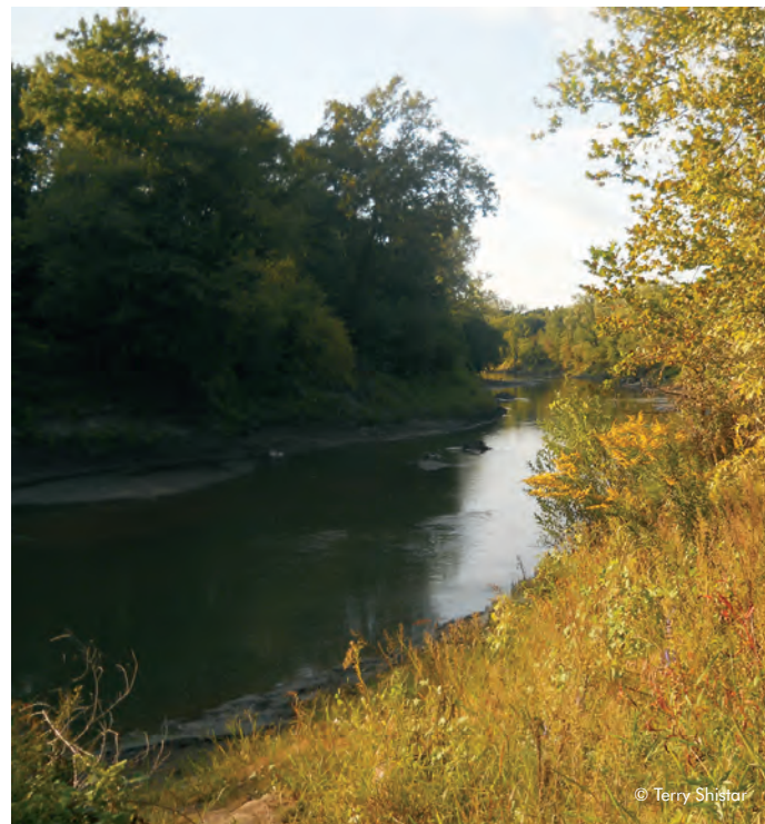
Protecting wildlife corridors, especially along streams.

begins implementing these practices, the benefits of a complex ecological system are realized through increased yields, reduced pest pressures, and reduction of disease.