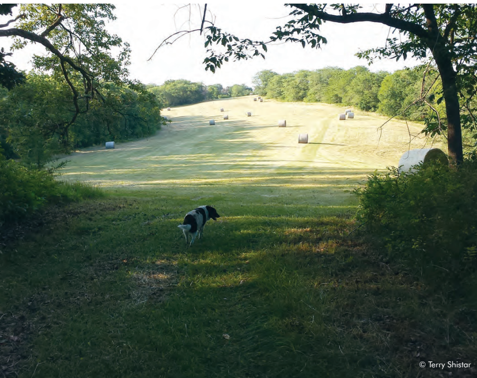
Hedgerows along hayfield.